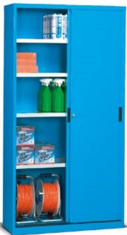
H 2000 mm

2 adjustable shelves ART. F AC 2450 01 99 - load capacity 100 kg