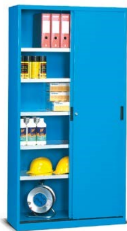
H 2000 mm

4 adjustable shelves ART. F AC 2450 01 99 - load capacity 150 kg