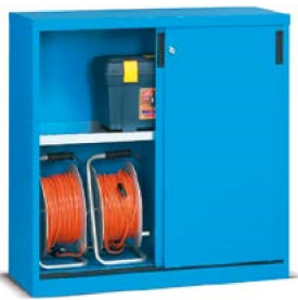
H 1000 mm