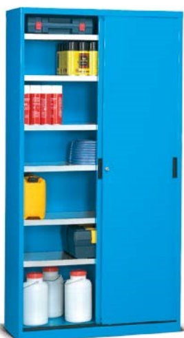
H 2000 mm

5 adjustable shelves ART. F AC 2450 01 99 - load capacity 100 kg