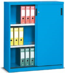
H 1200 mm

1 adjustable shelf ART. F AC 2450 01 99 - load capacity 100 kg