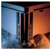
Strong and resistant to high and low temperatures