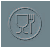
The stacking containers marked with this symbol can be used to store foodstuffs